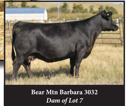
Bear Mtn Barbara 3032 Dam of Lot 7