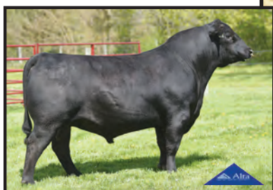
Bear Mtn Genuine 5022 Maternal brother to Lot 9