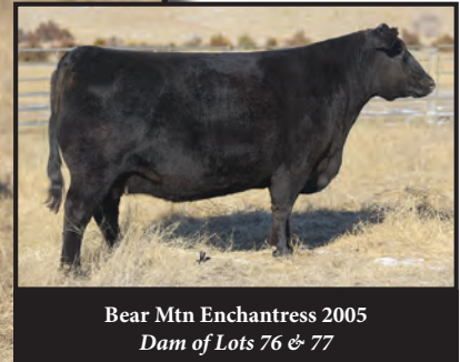
Bear Mtn Enchantress 2005 Dam of Lots 76 & 77