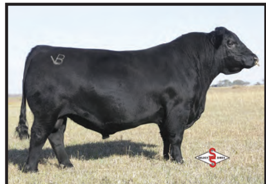
JMB Traction Full brother to Lots 54 - 56