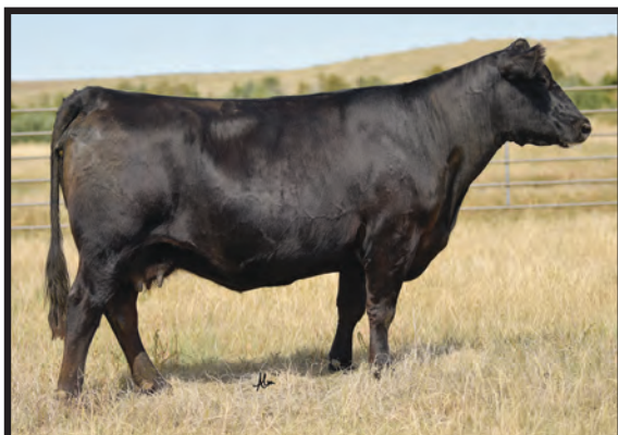
Bear Mtn Enchantress 2322 Sire of Lot 47