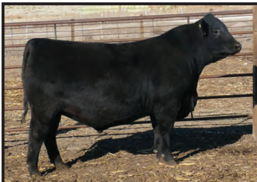
Bear Mtn Titan 4045 Full brother to the Dam of Lot 34