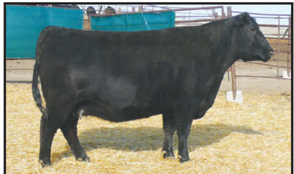
Bear Mtn Forever Lady 0001 Maternal Grand Dam of Lot 66