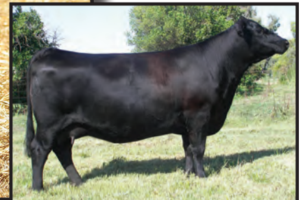
Bear Mtn Jamie 4101 Grand Dam of Lot 3