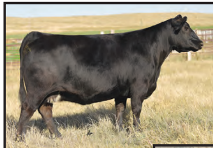
Bear Mtn Barbara 8106 Grand Dam of Lots 30 & 33