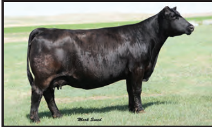
Stevenson Miss Manor 83S4 Dam of Lot 105