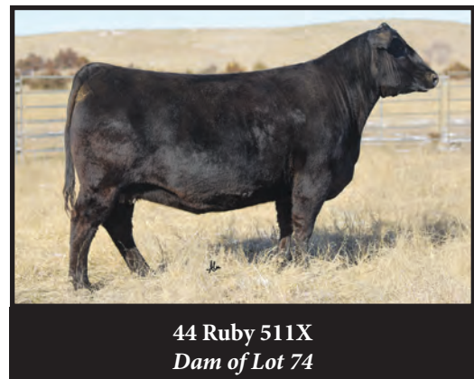
44 Ruby 511X Dam of Lot 74