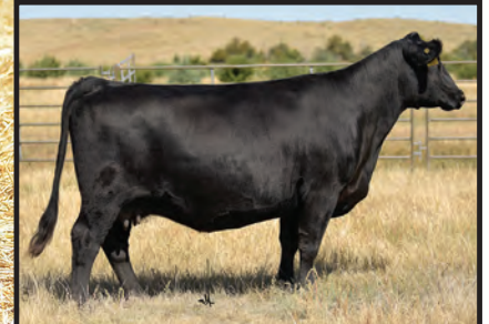
Bear Mtn Judy 3092 Dam of Lot 44