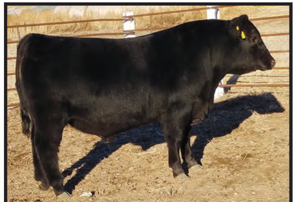
Bear Mtn Perfect Vision 6509 Sire of Lots 44 - 46