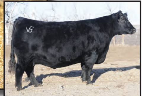
JMB Emulota 013 Dam of Lots 54 - 56

Top 1% Milk Top 2% YW, CW, $W & $F Top 3% RE & $B