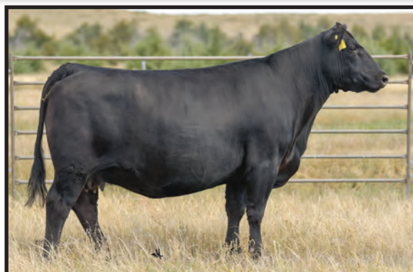
Bear Mtn Jamie 3141 Dam of Lot 61