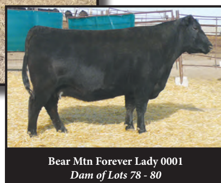
Bear Mtn Forever Lady 0001 Dam of Lots 78 - 80