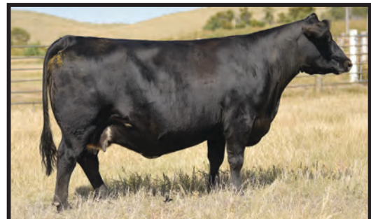
Bear Mtn Barbara 1046 Dam of Lot 30 & 33