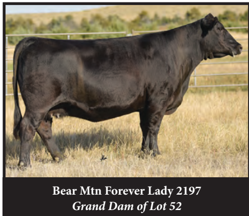
Bear Mtn Forever Lady 2197 Grand Dam of Lot 52

Yearling and Ultrasound info with updated EPD's will be available sale day. Look on our website for updates.