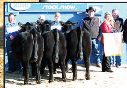
Dam of Lot 40 was a member of the Reserve Champion Pen of 3 Heifers at the 2016 NWSS