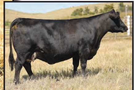
Bear Mtn Barbara 1046 Maternal Grand Dam of Lot 39