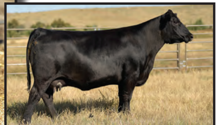
Bear Mtn Enchantress 5039 Dam of Lot 106