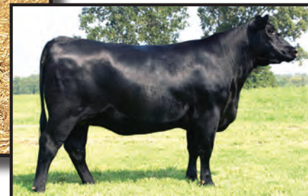
SQ Rita 128R of 3540 E161 Maternal Grand Dam of Lot 118