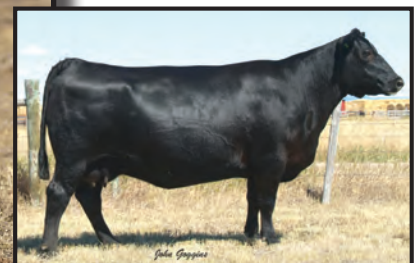
Stevenson Enchantress 449J Maternal Grand Dam of Lots 76 & 77