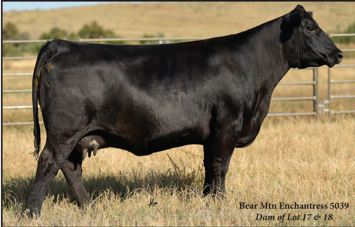
Bear Mtn Enchantress 5039 Dam of Lot 17 & 18