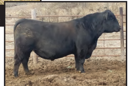
Bear Mtn Pure 5023 Maternal Brother to Lots 30 & 33