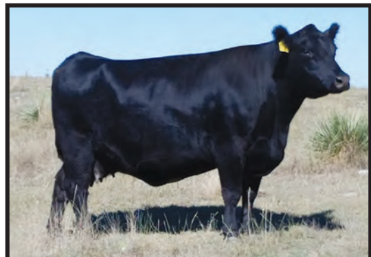
Bear Mtn Blackbird 9024 Maternal Grand Dam of Lot 34