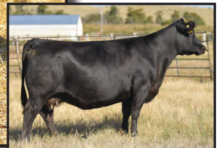
Bear Mtn Barbara 3032 Grand Dam of Lot 1

Top 1% WW, YW, $W & $F Top 10% CED, RADG & $B Top 15% BW & DOC Top 20% SC, Milk, CW & RE