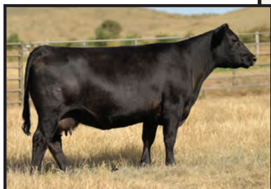
Bear Mtn Erica 1012 Dam of Lot 9