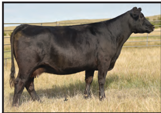
Bear Mtn Lady Eraline 1038 Pathfinder Dam of Lots 19 - 21